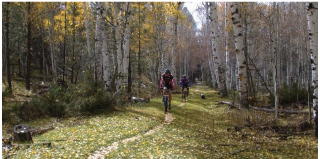
Riders enjoy fall along Quaking Aspen Trail, McGaffey, NM.

Abandoned logging roads and rail-bed spurs throughout the Zuni Mountain Range of the Cibola National Forest are ideal for re-use as hiking, biking, and equestrian trails. Trail connections are planned throughout the 2400 square