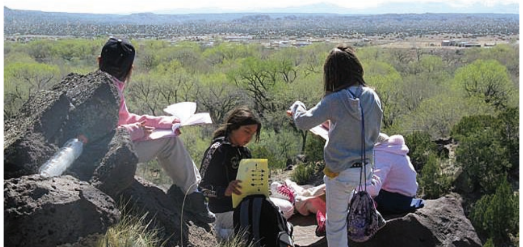
Youth recording petroglyphs in the Northern Rio Grande National Heritage Area.

Provide administrative support for task agreement(s) and assist the NRGNHA, Inc. with their management plan public input process and development with the NRGNHA board. Identify youth organizations and program opportunities and funding sources that would support the mission of the NRGNHA focused on traditional cultural practices and conservation of natural resources. Assist with mapping the existing heritage sites and opportunities within the NRGNHA and design and facilitate workshops. Create partnerships with cultural groups that are not predominately represented within the NRGNHA to obtain feedback on how to interpret their story. Conduct a recreational inventory and recreational gap analysis within the NRGNHA to identify existing and potential opportunities for public enjoyment of the natural, cultural, archeological, architectural, and historical resources of the heritage area.