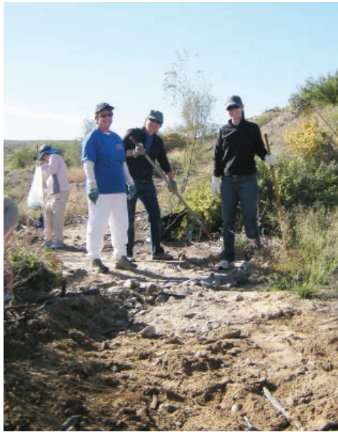
TorC volunteers construct new trail.

Work with the Merced del Pueblo Abiquiu to identify opportunities for engaging and educating youth on resource conservation and open space design within 10 acres of the 32-acre parcel of land. Organize and facilitate community input workshops on the open space design with the Rio Arriba county communities, as well as with key agencies at the state and federal level. Identify state, federal or non-profit organizations to organize training workshops on open space design for youth organizations within Rio Arriba County. Identify funding opportunities or resources to complete river restoration and land maintenance.