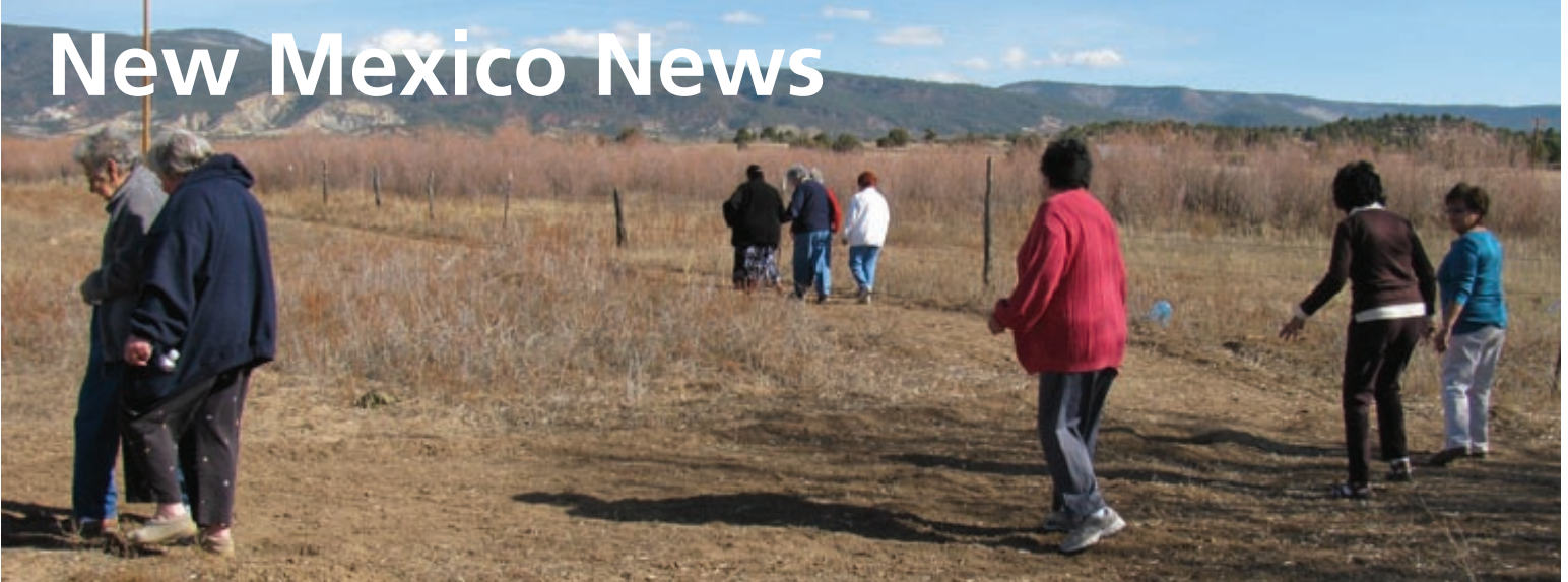
Cuba's Seniors Walking Group takes on new walking paths.