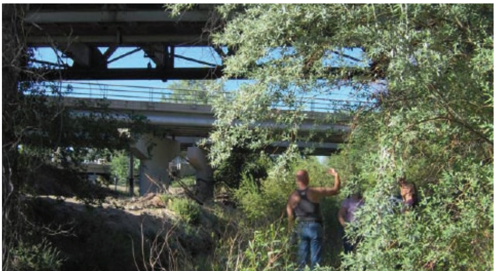
Trail surveying along the Animas.

Aztec Ruins National Monument, the City of Aztec, and Aztec Trails & Open Space (ATOS) have developed a concept plan for a trail system linking the community's major assets -- Animas River, the National Monument, Historic Main Street, and two large recreational sport complexes in the City of Aztec. This phase of the plan will develop three miles of trail