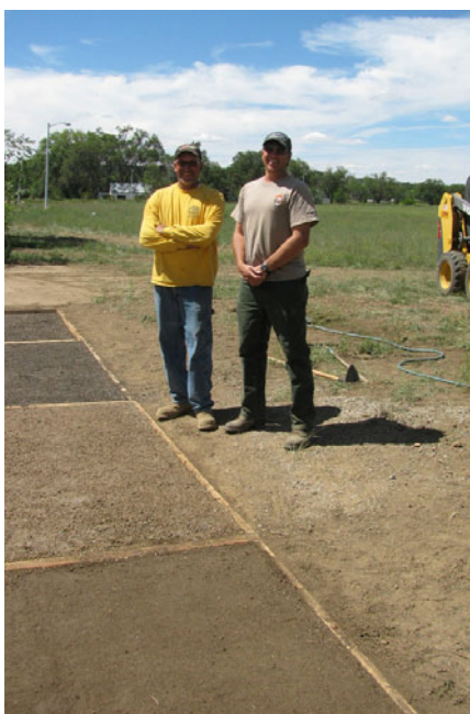
Completing trail surface test project in Cuba.

Most importantly, a pedestrian bridge adjacent to Aztec Ruins National Monument is now in the engineering and design phase. Once completed, Aztec citizens will have a riverfront trail system that connects its most significant community assets.