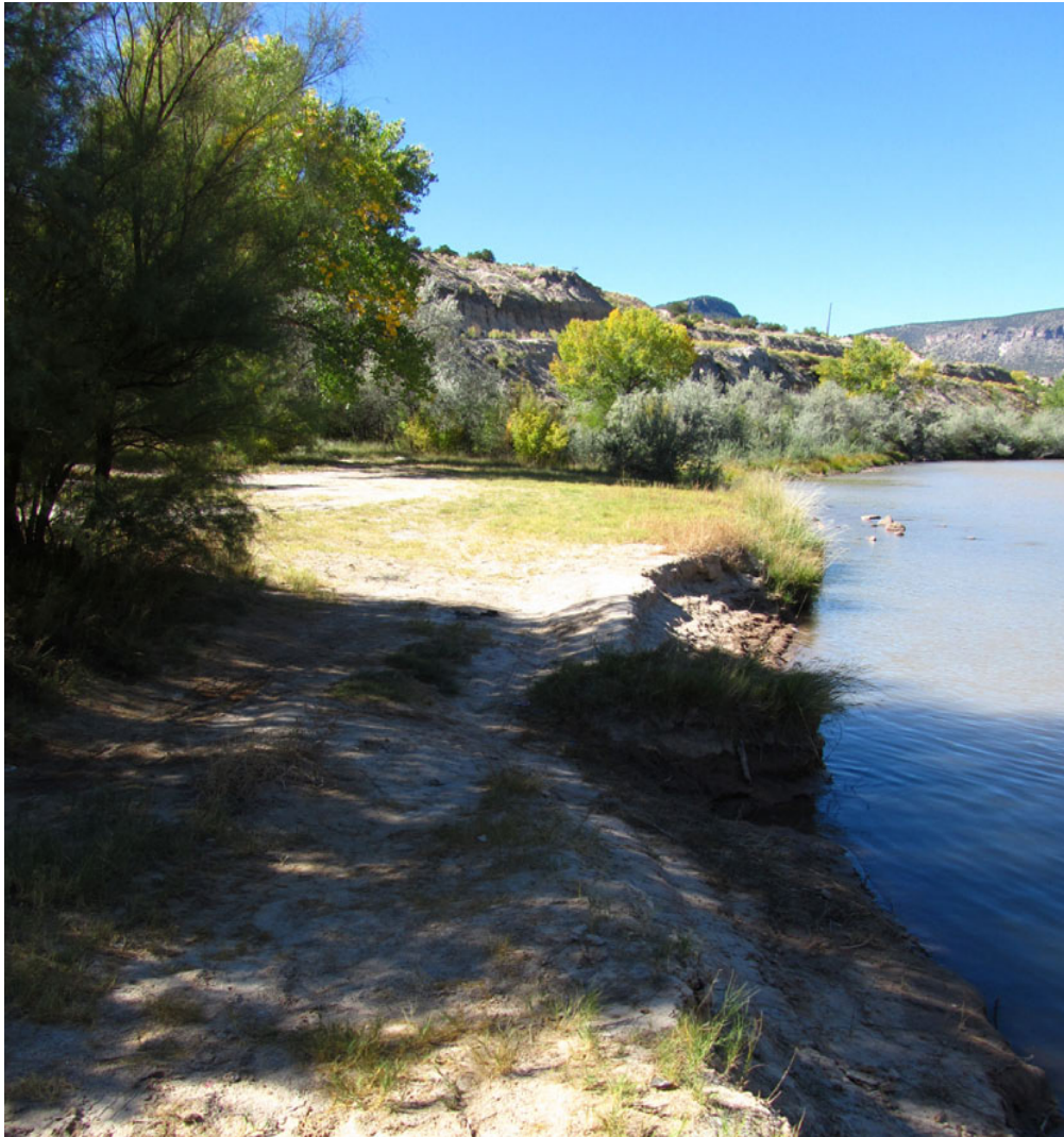
The Abiquiu Open Space Project looks to develop 21 acres of riparian habitat along the Rio Chama in Abiquiu, NM.