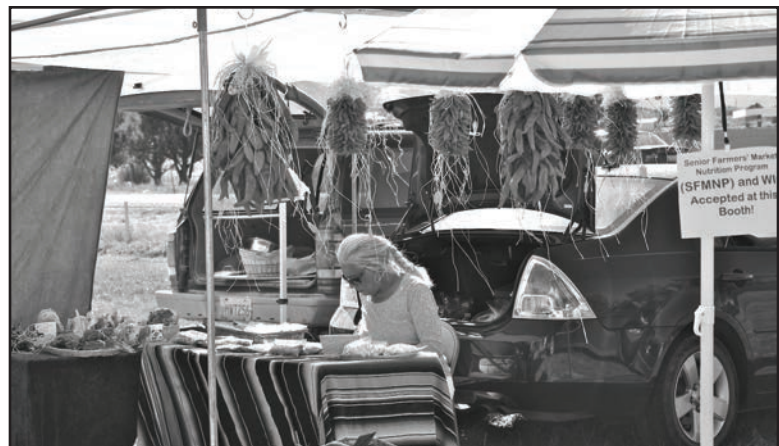
Dried Chili at the Cuba Farmers' Market

Cuba Farmers' Market Every Saturday through October 29, 2011 9:00 a.m. to NOON Village of Cuba St. Francis of Assisi Park