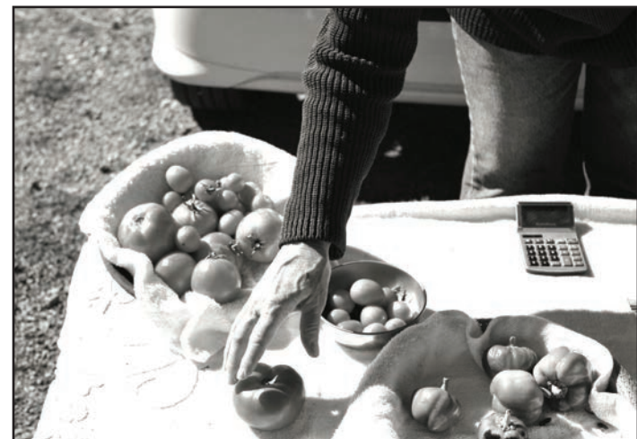
"Fresh Tomatoes at the Farmers' Market"