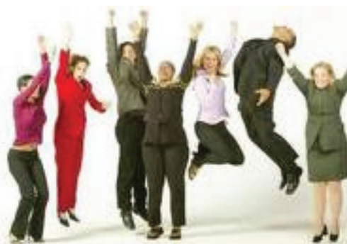
Work Site Wellness