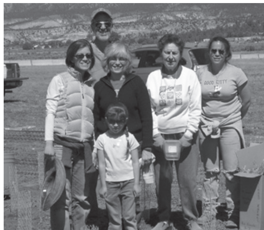
Planting Seedlings at the St. Francis of Assisi Park