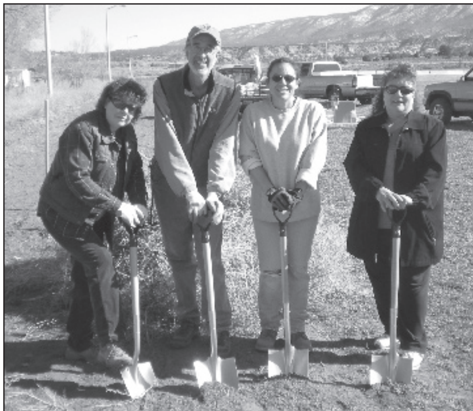
Ground-breaking of the Step Into Cuba Walking Trail