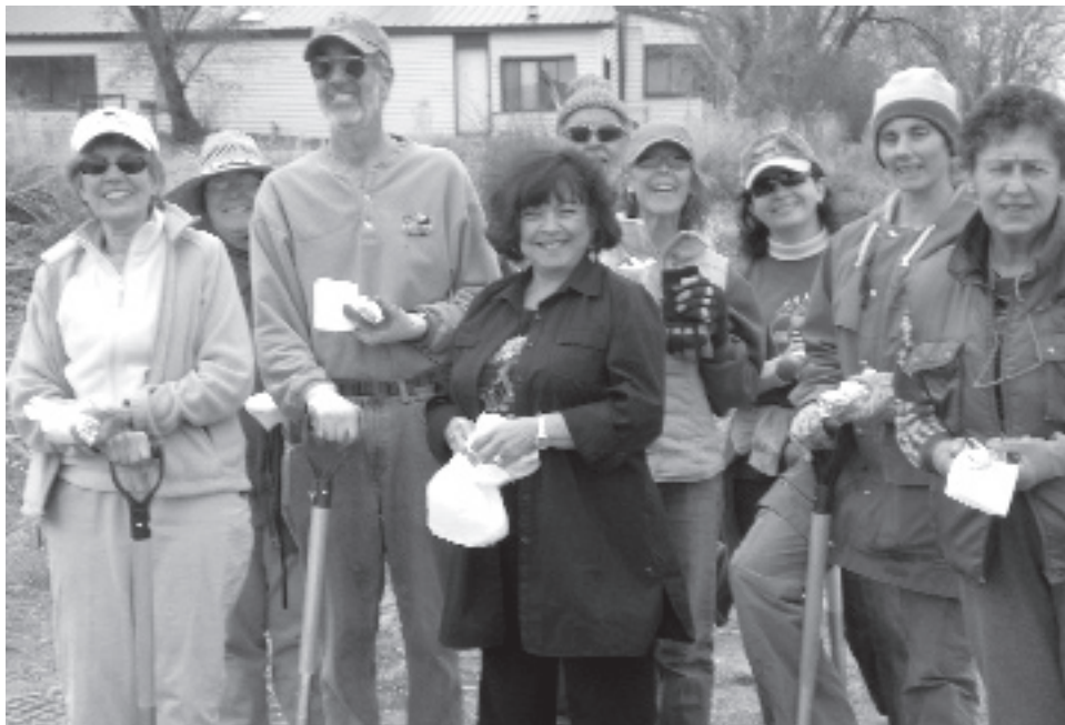
Volunteers braved the cold weather at St. Francis of Assisi Park in Cuba to plant seedlings and create a walking and nature trail around the perimeter of the park