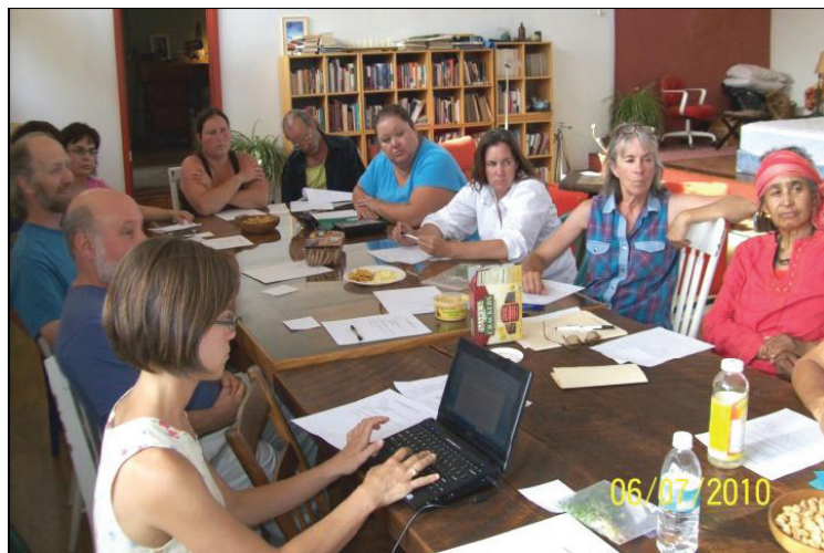
Cuba Farmers' Market Planning Committee members discuss ideas in June 2010

Decisions have been made carefully regarding everything from time, date and location of the market, to vendor guidelines and how this can be a successful and sustainable event for the area. The goal is to promote a healthy